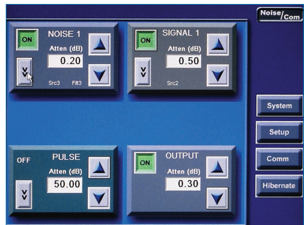
Intuitive standard control menu