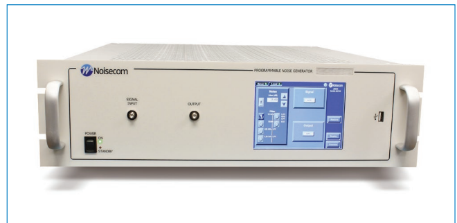
3U High - U7opt18

Wireless Telecom Group Inc. 25 Eastmans Rd Parsippany, NJ United States Tel: +1 973 386 9696 Fax: +1 973 386 9191 www.noisecom.com