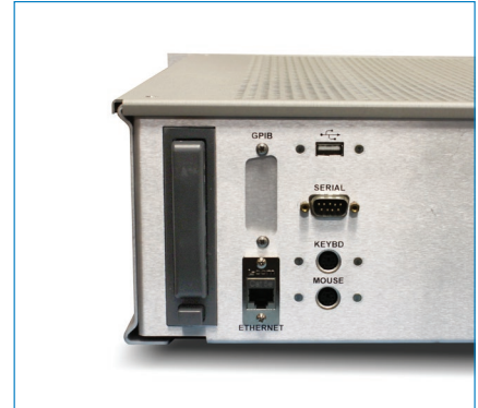
Removable drive - U7opt17