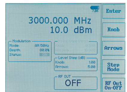
PMM 3030 Display

PMM 3010 and 3030 are powerful wide band signal generators, ideal for all EMC immunity test applications, designed adopting an innovative philosophy and state-of-art components.